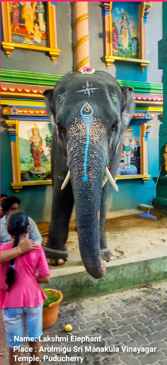
Name: Lakshmi Elephant Place : Arulmigu Sri Manakula Vinayagar Temple, Puducherry

For centuries, India has regarded the majestic royal beast, the elephant, as its cultural symbol. The highly revered Hindu God, Lord Ganesha, is said to be a remover of obstacles and a provider of fortune and good luck. Considering this beloved God has been envisioned with an elephant head and a human body, elephants are believed to be an incarnation or representation of Ganesha. Furthermore, people believe that Lord Indra, the God of rain, thunder, and lightning, has a divine white elephant as a mount, thereby establishing elephants as a symbol of divinity and royalty.